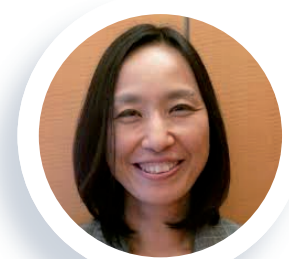
Yuriko Matsuno Tokyo