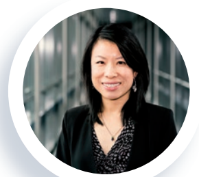
Na Shi China, Asia