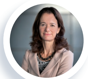
Edith Stein Middle East South Eastern Europe