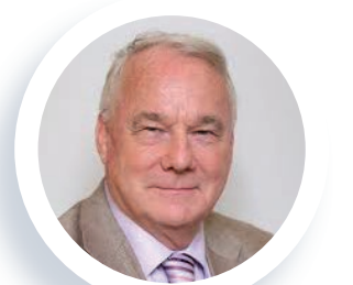
Hugues Mignot Taipei