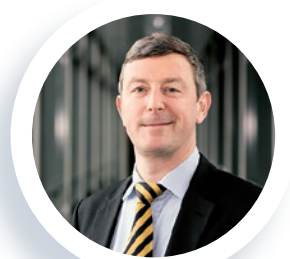
Charles-Emmanuel de Ribaucourt Credit analysis