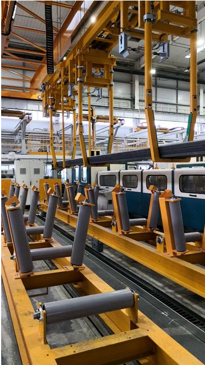
Crane & Floor Conveyer in installation