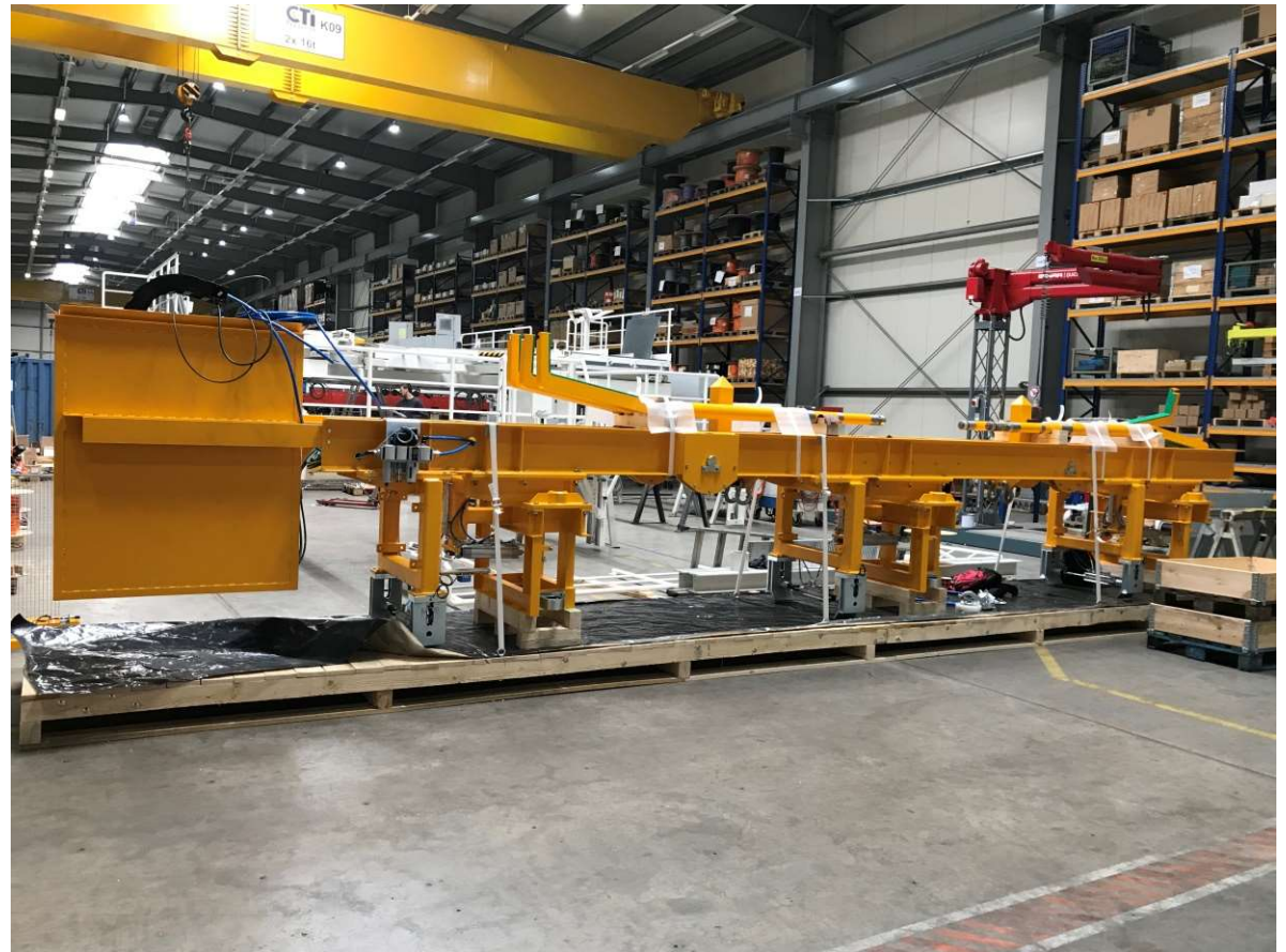
Gripper before shipment by Air Cargo