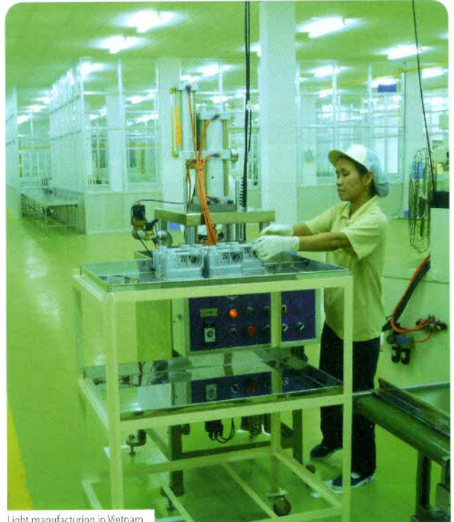
Light manufacturing in Vietnam

A trade mission will accompany a state visit from 28 February to 4 March, honoured with the presence of HRH Grand Duke Henri. For information, please contact: loic.bertoli@eco.etat.lu or international@cc.lu . To register, please go to www.luxembourgforbusiness.lu