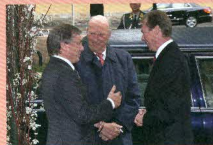
Minister for the economy and foreign trade Jeannot Krecké with King Harald and Grand Duke Henri