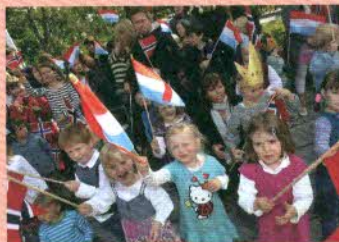
Children welcome the royal party to the StatOil research centre