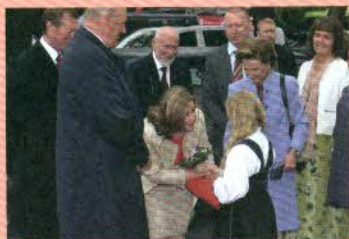
Grand Duchess Maria Teresa accepts flowers as the royals are welcomed to the Fram Museum