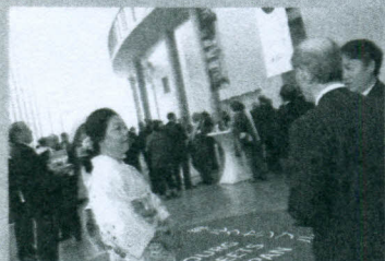
⬆ East meets west, culture meets business