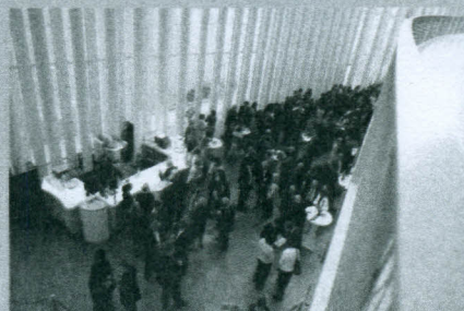
⬆ The meet and greet took place in the Philharmonie