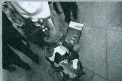
⬆ Tourism was one of the focuses of the event